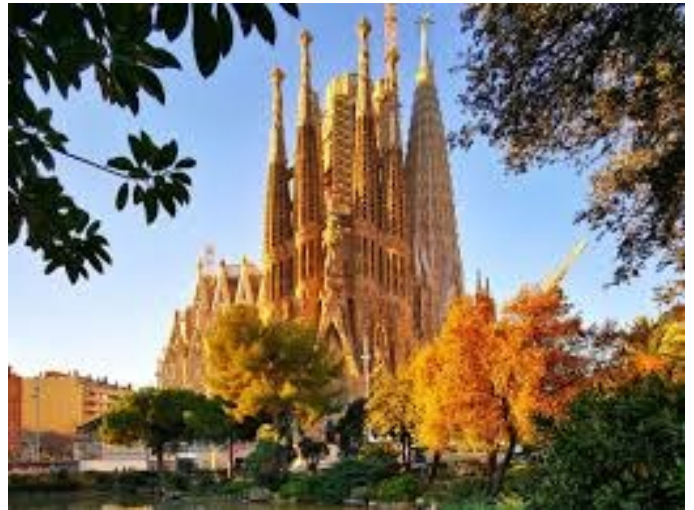
BARCELONA, Sagraada Familia Cathedral