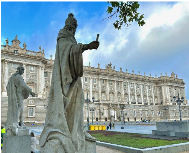
MADRID, Royal Palace