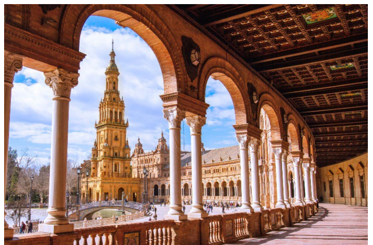
SEVILLE, Plaza D'España