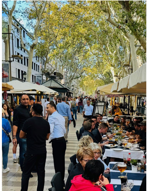
BARCELONA, The RAMBLAS

Please join us for an informal yet informative paseo through two thousand years of this charming culture.