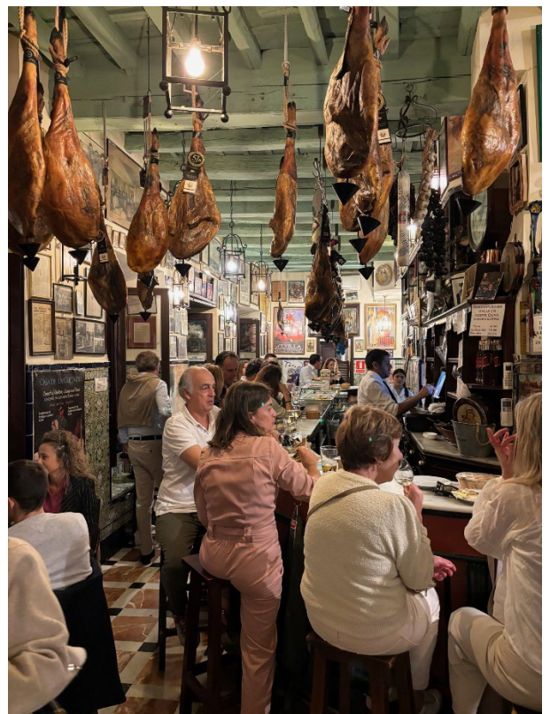
SEVILLE, Tapas Bar